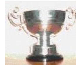
Jack Quain Trophy 5 Times