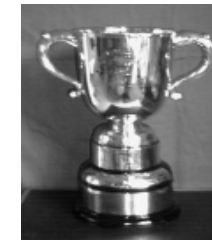
Haig Cup 2002

of which you could be a member! Why? How? Read on!