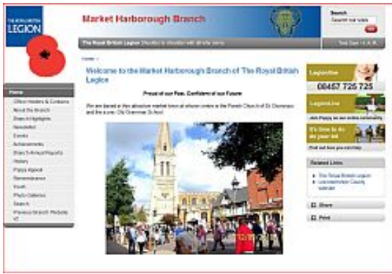
New Branch Web-site June