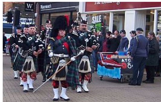
Poppy Appeal Launch November