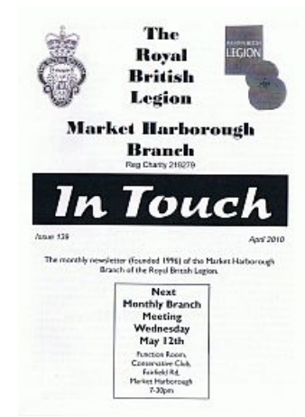
New Format of In Touch , the Branch Newsletter March