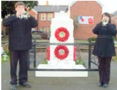
Young Musicians play at Sunset Ceremony November