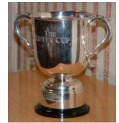
Lister Cup 2004