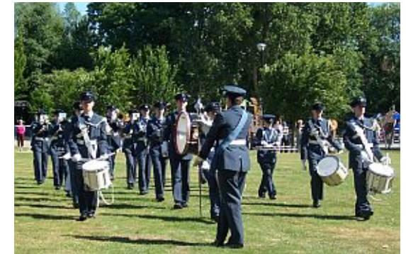
Armed Forces Day ATC Marching Band July