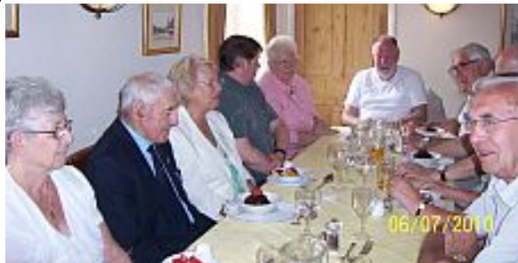
Monthly Lunch at The Angel July